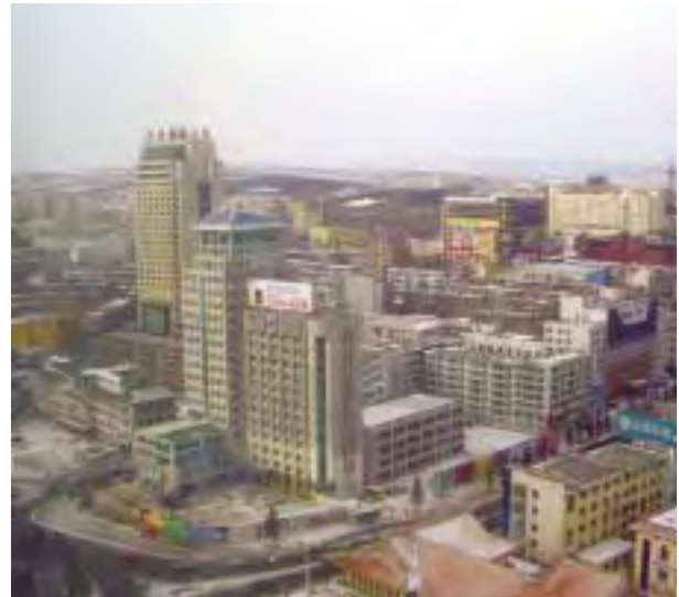
The city of Yanji, capital of Yanbian Korean Autonomous Prefecture in China.

Most interviewees were by and large still content to continue living in China, as they are in close proximity to North Korea where many of their family members still reside. Some, however, find living in China too stressful because of the insecurity and the need to constantly guard their behaviour. The South Korean Government's policy of extending citizenship to North Koreans offers these border crossers in China something they have longed for: legal status. Through regularisation, border crossers would be able to "live without fear and have peace of mind". As a Kyongsong resident pointed out: