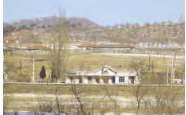
A North Korean train station near the Chinese border.

going through their menstrual cycle. After we cleaned our bodies, then we had to use the same water to clean the floor of the room. Then finally the water was used to flush the toilet. 66