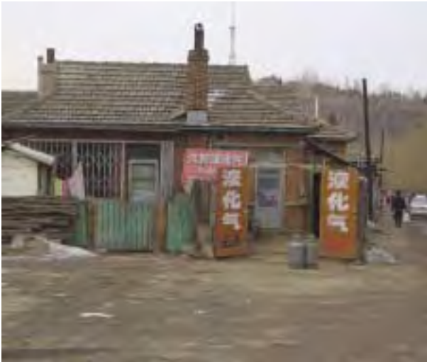
A rural neighbourhood in Jilin Province.

Rural residents, on the other hand, do not have the luxury of anonymity. Villagers know exactly where North Koreans live. One 28-year-old woman from Onsong was arrested three times by the same police because “all the villagers knew I was North Korean so when there was a crackdown, the police knew where to go”. After the third arrest, she and her husband finally decided to move out of the rural village: