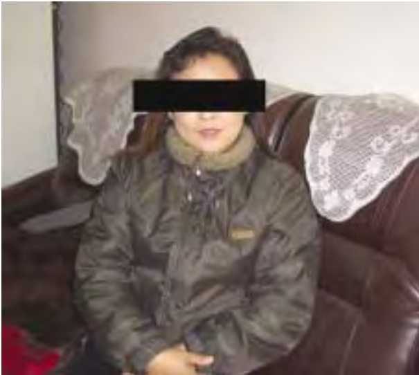
A North Korean interviewee.

asked. During a 40-minute trial in 2005, a woman from Kyongsong, aged 30, was only instructed to read out loud her confession. After she confirmed the validity of the statement, the officials sentenced her to six months in a re-education camp. She was released for time served. 119