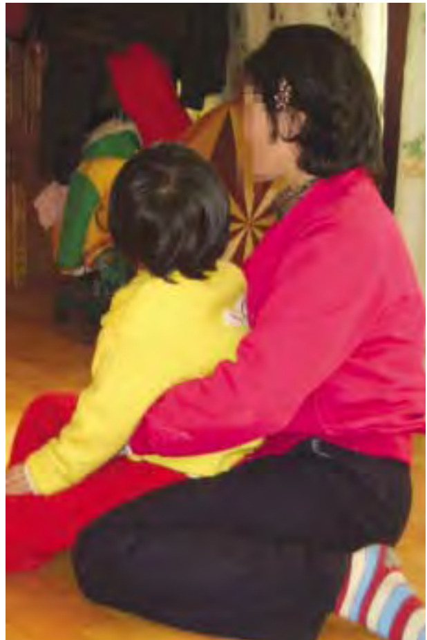
A North Korean woman married to a Chosun Jok farmer with her daughter.

In this political climate, North Koreans living in cities fear exposure from being reported by their Chinese neighbours, so they keep to themselves and avoid venturing outside their apartment. But this isolation makes them long for contact with other North Koreans. As many of the case studies indicate, this contact brings its own risks.