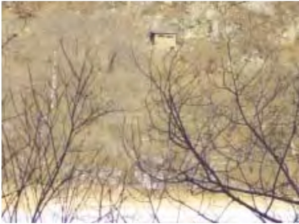
A North Korean guard post along the Tumen River.

(e.g. in contact with South Koreans or Christians or caught en route to South Korea). In general, the former were sent to a labour training camp ( nodong danryundae ) or a re-education camp ( kyohwaso ), while the latter were incarcerated in a political prison camp ( kwanliso ).