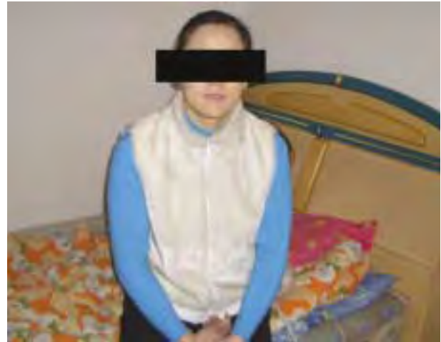
A North Korean interviewee.

We were sent to building construction sites where we carried, in pairs, stones and cement. I was hit a lot - all over my body - because I was not walking fast enough. My legs hurt a lot so I couldn't keep up with the others. Only the prison guards hit us, not the team leaders. I also weeded in the cabbage patch. I was hit for various reasons