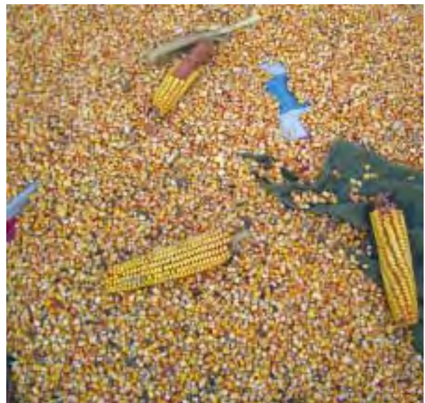
Corn kernels being dried in the sun.

Because I wasn't eating properly, my hair fell out in lumps - I still have bald patches today. Due to malnutrition, my nails were so weak that they would turn over. 100