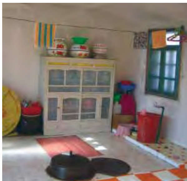
The kitchen of a rural farming household in Jilin Province.

Like the 38-year-old, many women who travel to China have aspirations of finding a job and sending money to their families. But once they arrive, they realise that earning money in China is not as straightforward as they previously believed. Their relatives or people with whom they stay inform them that it is dangerous in China and the best way to survive is through the protection of a man. From that point on, the women are easily convinced that they would be better off getting married to a Chinese man. They