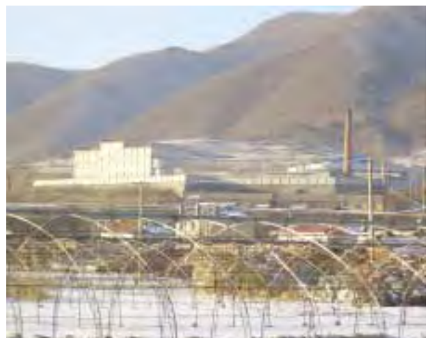
The Tumen border detention centre.

In general, the period of incarceration for undocumented North Koreans at these border facilities is brief. Their deportation, however, can be delayed because they are too sick to travel or have to wait either for more North Koreans to arrive or for the conclusion of a trial involving them and a Chinese citizen. One 32-year-old woman from Kilchu was arrested at the Yanji bus station in July 2006 as she was about to board a bus for Shenyang (en route to South Korea).