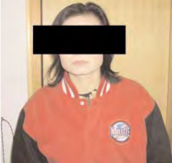
A North Korean interviewee.

Female prisoners used strips taken from their underclothes to use as sanitary napkins during their menstrual cycle. They sometimes had to use the strips again without washing them. 96