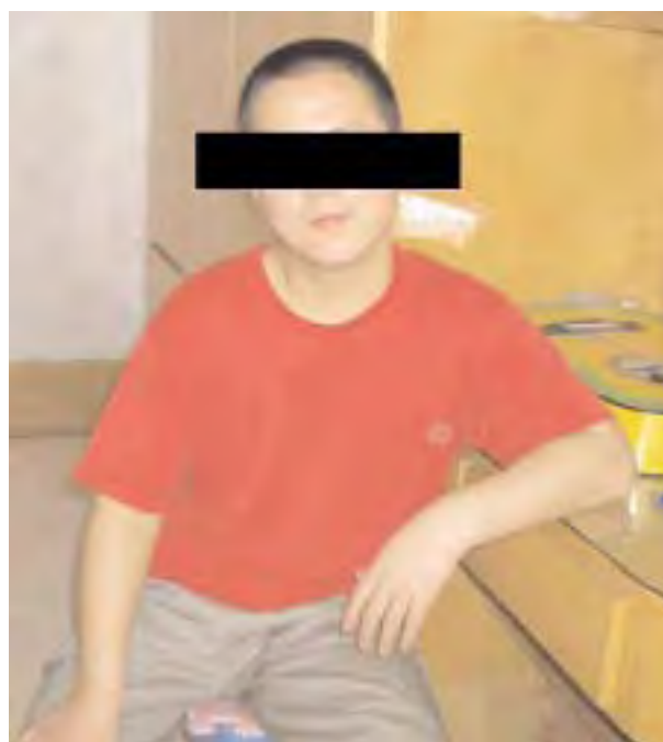
A North Korean interviewee.

[...] had all the team leaders punished by making them move heavy rocks from one place to another - about 100 metres apart - until he said stop. The team leader responsible for the sleeping prisoner was so angry that he took a stick and beat the prisoner's back and legs. The prisoner couldn't walk for three weeks. He suffered a fracture in one leg. 79