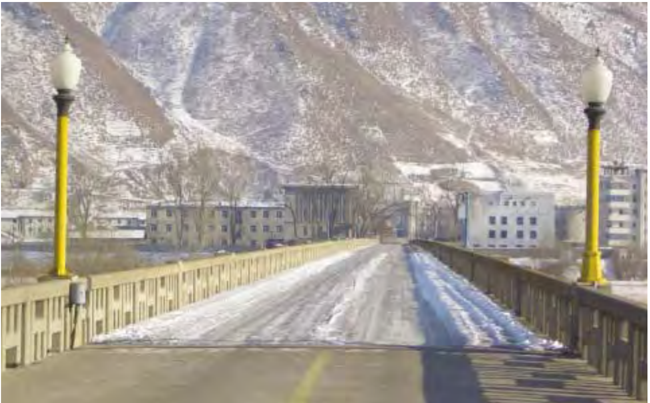
The Tumen Bridge.

Their personal details are registered again followed by a humiliating body search. Guards engage in a very thorough and invasive search because prisoners go to great lengths to hide money, either by wrapping it tightly in plastic before swallowing it or inserting it in their vagina or anus. The reason so many hide money is because they need it during their incarceration to buy food or medicine or to bribe guards (e.g. for better treatment or early release). Prisoners are told to undress, put their hands behind their head and squat and stand repeatedly with their legs spread wide while a guard watches for any money to drop from their private areas.